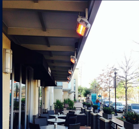
Heaters built-in to overhang