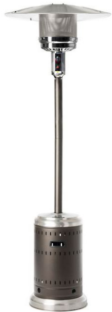
Portable heaters with propane tanks