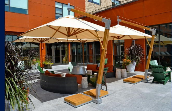
Installed large umbrellas