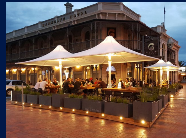
Planters as barriers