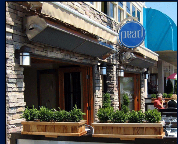
Built in heaters, attached to building

Pictures are for illustrative purposes only. The concept involves permanently installed (including power/fuel) heating systems.