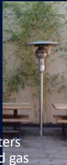
Built in heaters with plumbed gas