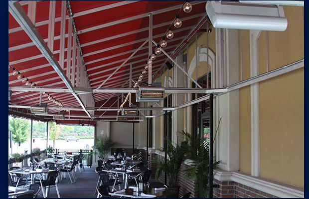
Heaters installed as part of awning or pergola structure